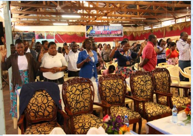
An Interdenominational Leaders' Seminar at JWC

The typical worship activities and programs consist of; Sunday Services, Youth Sunday Service, Sunday School and Teenagers Services, Sunday New Believers (Discipleship) Classes, Monday Evening Meetings, Tuesday Interdenominational Pastors Prayer meeting, Tuesday Evening Choir Practice, Wednesday Evening Bible Study Meeting, Thursday Evening Home Bible Church (Home Cells) Fellowships, Friday Overnight prayers meetings, Week end Evangelistic Crusades and Youth Empowerment services