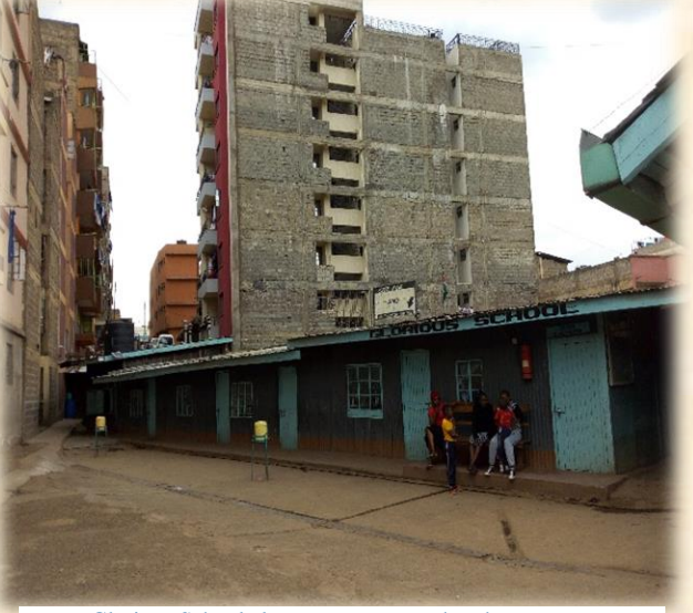
Glorious School classrooms next to church sanctuary

government's efforts in providing both pre-school and primary education to a total of 561 pupils (Males=281, Females=288) with the help of approximately 21 teachers (Males=8, Females=13). Some of the needy students are provided with sponsorships to complete their education at Glorious School. Needy alumni are sponsored to join secondary schools, while those who have cleared secondary are sponsored to join universities. About 20 Form 4 and colleges graduates were