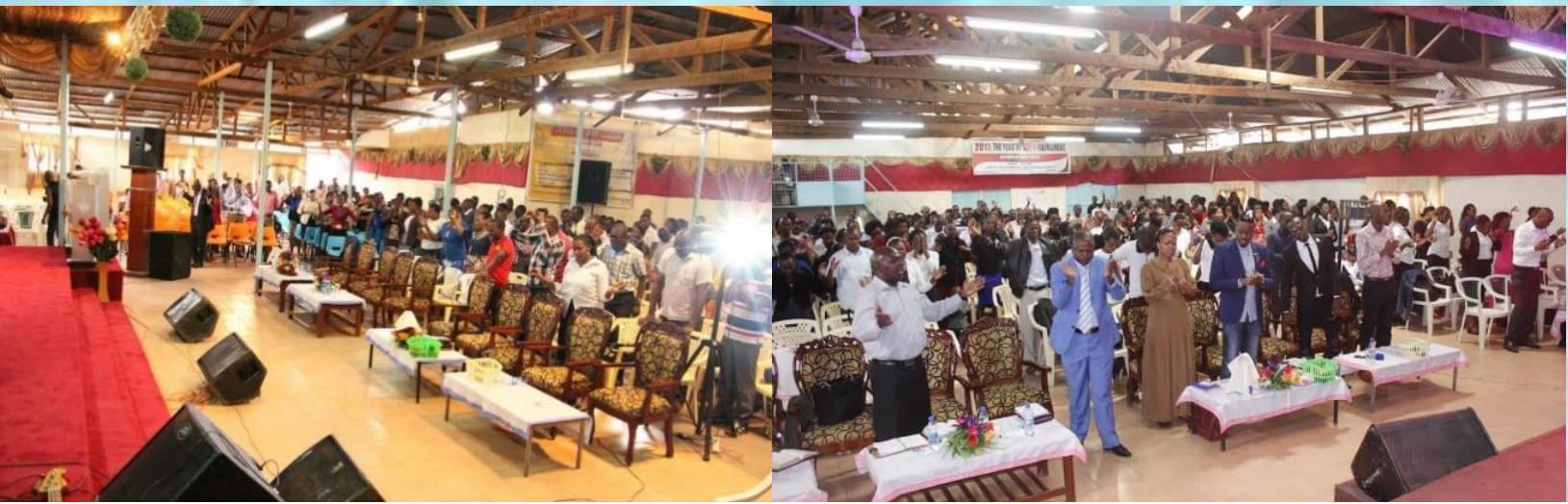
Praise and worship session on progress