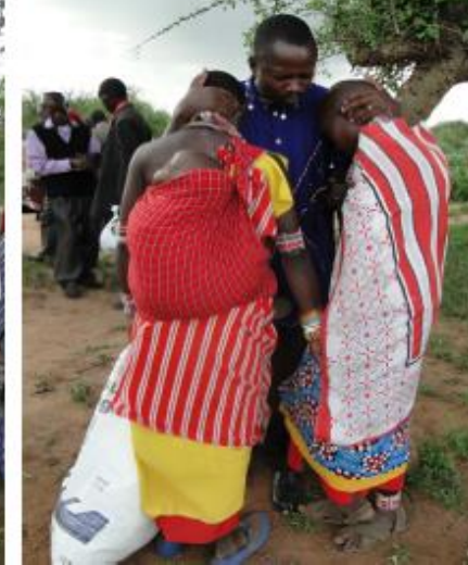
Two sisters, one in primary school class three, came to receive prayers after being forced into early marriage